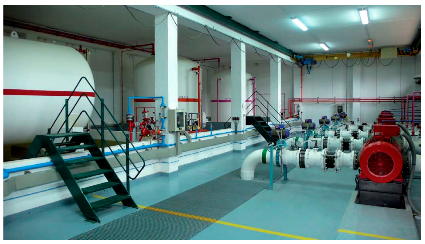
Picture 7: Inside desalination plant in Alicant, Spain.

Interest in the use of desalination technologies for drinking water production has increased in Turkey in recent years due to severe drought events experienced in last few years. Desalination technology is mostly used in Aegean coast by touristic facilities. While total capacity of desalination plants had been merely 3,600 m<sup>3</sup>/day in 2002, today it is nearly 31,000 m<sup>3</sup>/d. It is expected that before the end of 2008 total capacity will reach 120,000 m<sup>3</sup>/d and this is expected to triple in 5 years.