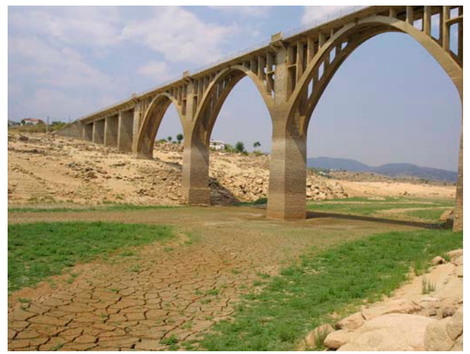
Picture 6: Parched Burguillo Reservoir in the Tajo catchment.