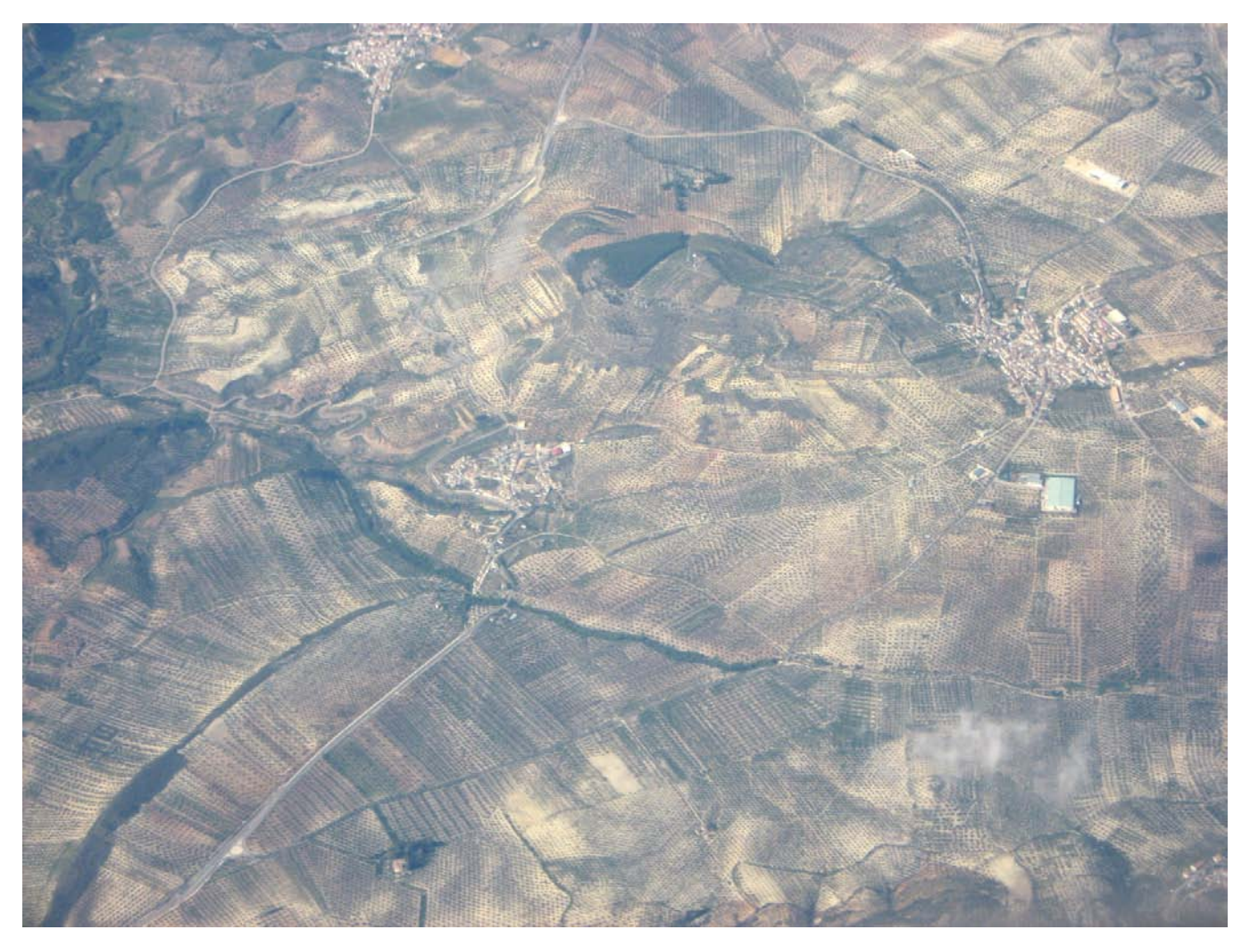
Picture 8: Irrigation expansion in southern Spain.

Already today, there is a trend of migration into cities, leaving the old generation back in the villages and countryside, with decreasing social services available to them. Traditions and the social network in the rural areas will seriously impacted by chronic droughts, directly by the economic impacts, but also indirectly by the younger generation fleeing to the cities and the job opportunities offered there. In the cities, this influx of rural migrants also stretches then further the social services, housing and the employment opportunities.