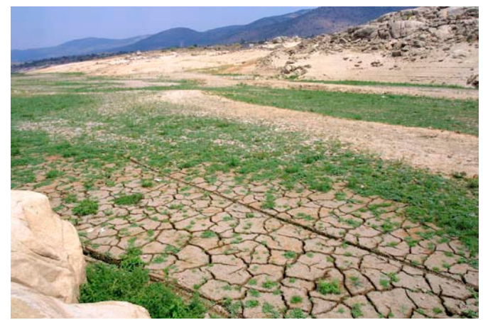
Picture 2: Drought in the Burguillo reservoir, in the Alberche River (Tagus watershed).

In February 2008 the Turkish Grand National Assembly (TGNA) agreed on the creation of a "Research Committee for the Effects of Global Warming and Sustainable Water Resources Management", inviting relevant institutions and organizations (including WWF-Turkey) to the Assembly and to work together on the preparation of an comprehensive report to be presented then in the National Assembly.