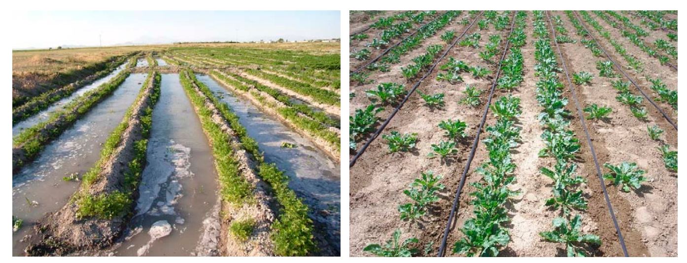
Picture 3: Contrary irrigation systems: Wasteful (left) and water efficient (right) irrigation systmes.

Since aquifers are more resilient to drought than surface reservoirs, dry meteorological conditions increase incentives for drilling illegal boreholes to access water for irrigation or recreational uses (e.g. golf courses). For instance, the newspapers recently reported a significant increase of illegal wells in the Guadalquivir, as in 2007 the river basin authority filed a legal record to 607 illegal wells while in 2006 it filed only 159 records. The interviewed officer explains this increase saying that the drought has already lasted 4 years and there are no more surface water reserves to face the prolonged drought<sup>51</sup>.