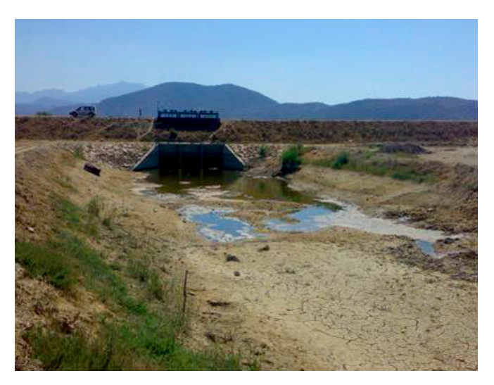
Picture 5: No flows left at the dam at the Great Menderes River.