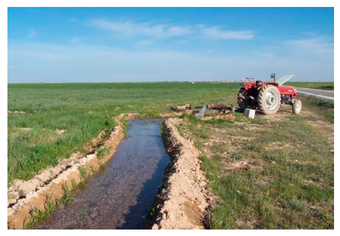
Picture 4: Illegal ground water extraction in Konya basin.

Total arable land in Turkey is 28 million ha and 8.5 million ha of this area is suitable for irrigation. Currently, Turkey's dams provide water for 4.89 million ha of arable land. It is estimated that by 2030 total irrigated arable land will increase and reach 6.5 million ha.53