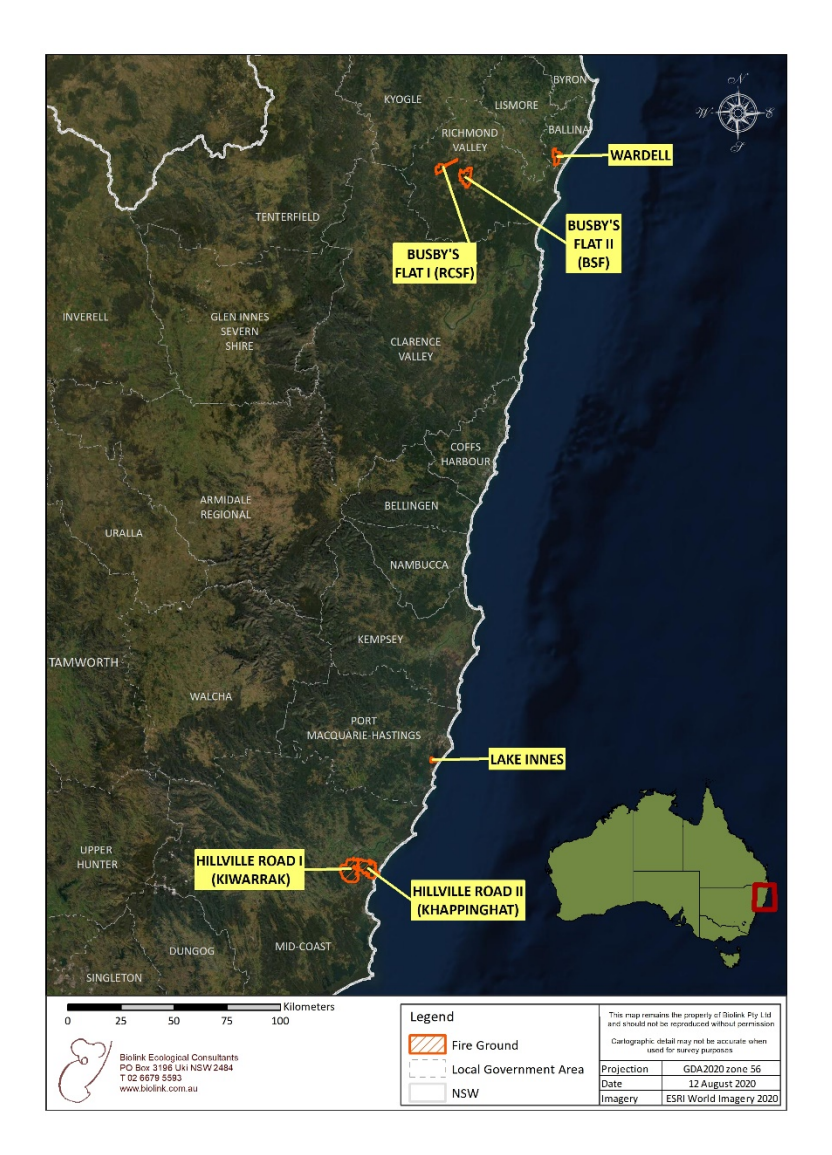
Figure 1 . Locations of the six fire-grounds resurveyed on the NSW north coast between Foster and Wardell in terms of NSW Local Government Area boundaries.

Survey work was completed over three-month period (Mar – May 2020). Two hundred and twenty-seven (227) field sites distributed across six fire grounds were potentially available for re-assessment, 123 of which were able to be re-surveyed. Not all areas within individual fire grounds were able to be accessed because of safety concerns and/or logistical issues such as fallen trees across tracks. Figure 1 illustrates the locations of each of the six fire grounds that were sampled.