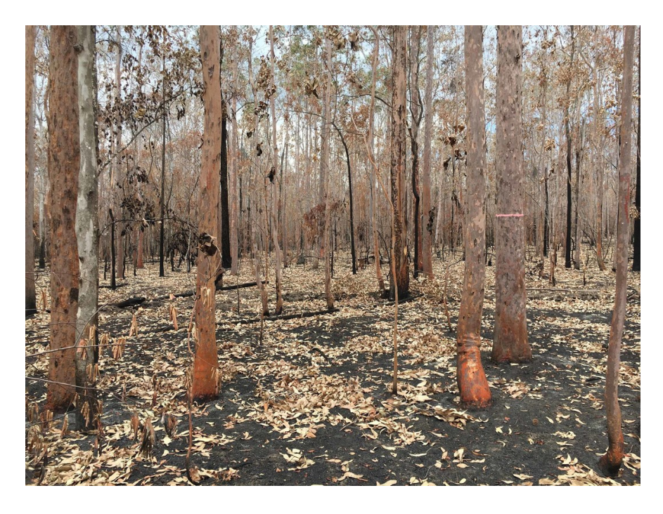
Bushfire ravaged Busby's Flat, NSW.

Twenty-two (22) sites were able to be resurveyed in the RCSF, 11 of which were known to have pre -fire evidence of habitat use by koalas. Post -fire, three of the 22 field sites returned evidence of habitat utilisation by koalas. Twenty-one (21) field sites were resurveyed in BSF, of which four were known to have pre -fire evidence of habitat use by koalas. Post -fire, two of the 21 field sites returned evidence of post -fire utilisation by koalas, both of which did not have scats recorded previously.