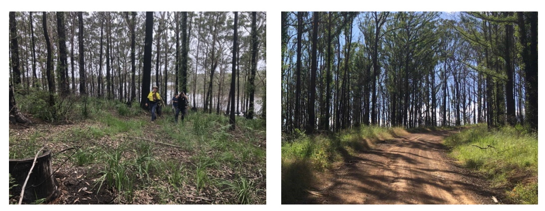
Left: Ecologists search for evidence of koalas in post-bushfire area at Lake Innes, © WWF-Australia / Mark Symons. Right: Kiwarrak where researchers found no evidence that koalas survived the fire, © Biolink